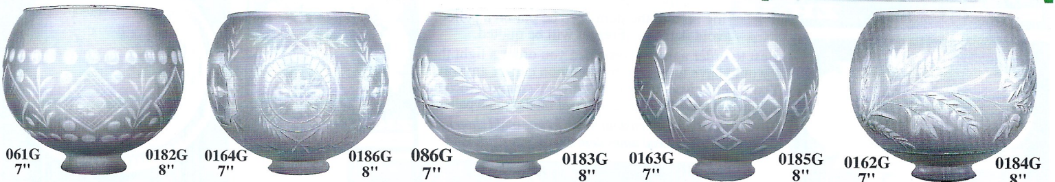
061G 7" 0182G 8" 0164G 7" 0186G 8" 086G 7" 0183G 8" 0163G 7" 0185G 8" 0162G 7" 0184G 8"

Oval, Mirror Head, Curtain tie back The mirror head actually has a wheel cut design in the center- sorry for the shadow on the mirror--hard to take pictures of mirrors. ZLW-2CTB Nice Lost Wax cast piece supplied in bright polished finish. The Oval head is 6" long by 3 1/2" wide. Overall: 10 3/4" long which is the head plus strap. Lots of space for a curtain. Fully reversible, order two for a set as they are sold each.