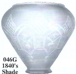
046G 1840's Shade

Mentioning the Mitchell Vance catalog above, it will be noted that we have also recreated the crown tops that some shades of this early era boasted which gave them just a bit more impact. Our crowns are Lost Wax cast. 014CT is for 7" ball shades (ID 5 5/8") while the 015CT is for the 8" ball shades (ID 5 7/8"). Polished finish