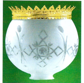
014CT for 7" shade

Same dimensions as the 4 light, just more of it. Lovely.