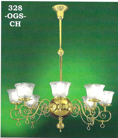
328 -OGS- CH

503-MES Simple plain sconce that matches just about everything. Can be modern, can be 1900's...even put with a nice curley Oxley Chandelier (opposite) and it still blends in. The original was 1900's but the design is almost timeless. 13 1/2" in height (with shade); projects from the wall: 8" and has a 6" canopy. You can dress it up, or down, with the shade you choose. Both fixtures are UL rated for 100 watts. Shades sold separately