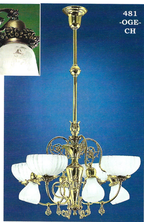
481 -OGE- CH