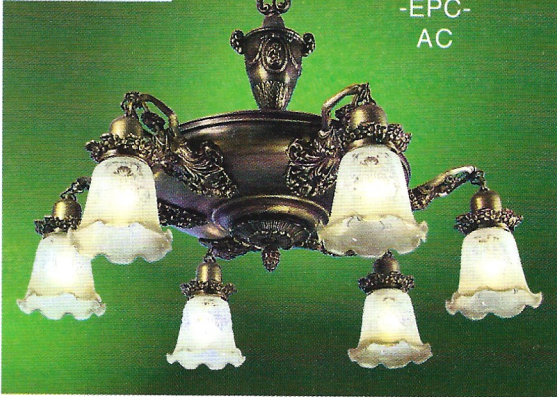
335 -EPC- AC