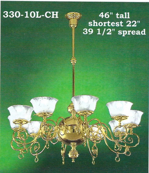
330-10L-CH 46" tall shortest 22" 39 1/2" spread