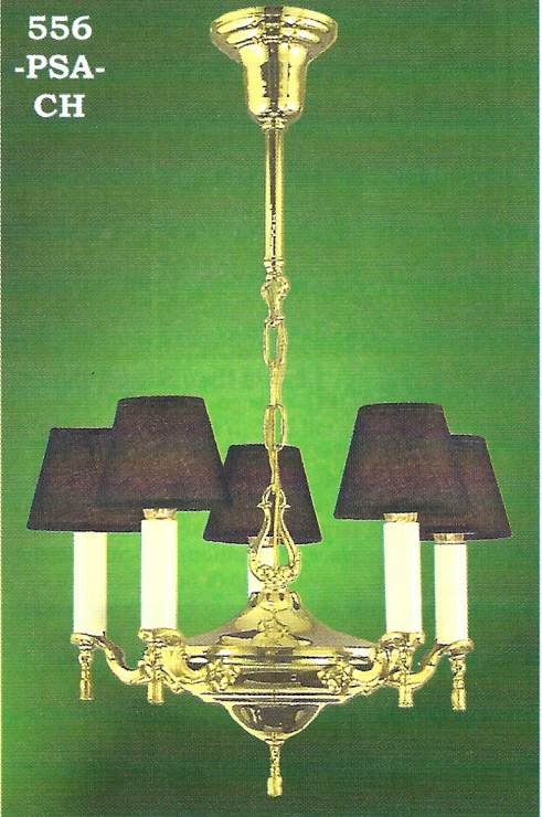
556 -PSA- CH

149-DL-206 A break in procedure for us here with this lovely Deco single hanging light. This light is sold as a set with the impressive 0206G decorated deco shade. Solid brass lost wax cast parts, heavy cast canopy and angular deco chain.