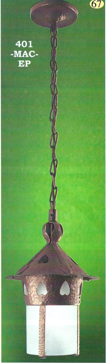
401 -MAC- EP

401-MAC-EP Stickley heart pendant. Ceiling canopy is 4" diameter. Overall length is 25 1/2". Lantern is 8" tall by 3"; frosted glass. Arts and Crafts homes did use these in multiples along a beam, over a work area.