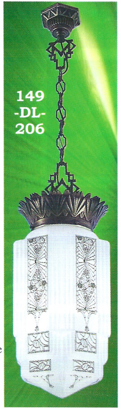
149 -DL- 206

9471-K Arts & Crafts porch light. Almost gives one a sense of oriental "Shabby Chic" as well, but not quite. Solid brass with antique finish. UL listed for "Wet" location so you can install this light outside. The glass of this light is crackle glass. Rated, for safety, for a 60 watt bulb. Meas: 12" tall by 9" wide; Projects 9 3/4"