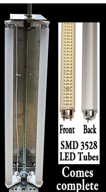
Front Back SMD 3528 LED Tubes

Consists of two SMD energy efficient 24" tubes mounted in standard T-8 holders. Quality SMD tubes are the next step in LED technology. SMD Tubes are easily changed by removing the top finial (and cap). This allows the PMMA lens to slide upwards giving full access to the interior of the light. (see below)