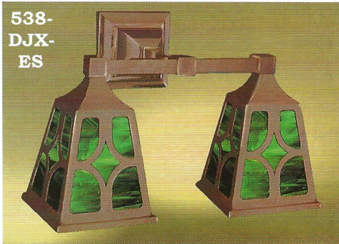
538- DJX- ES

538-DJX-ES Double "Mission" wall Sconce Width: 15.25", Projects: 9" Tall: 10"