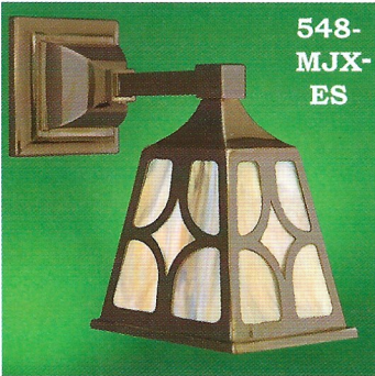
548- MJX- ES