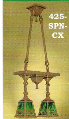
425- SPN- CX