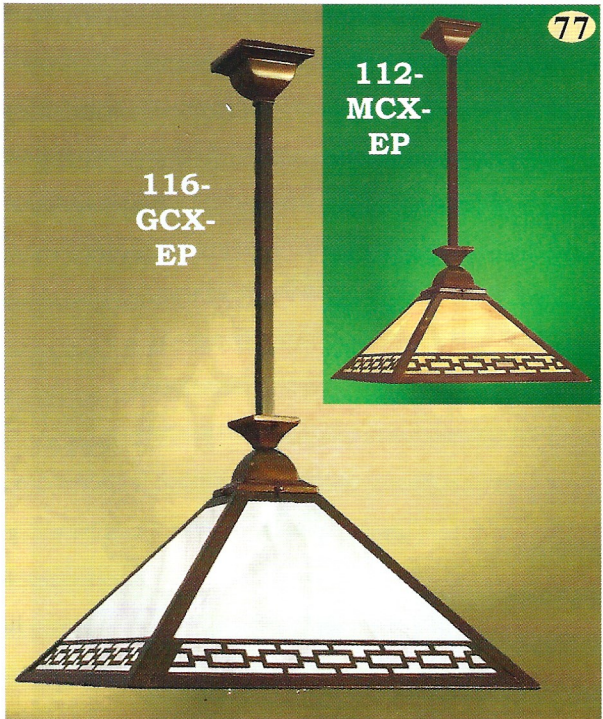
112- MCX- EP