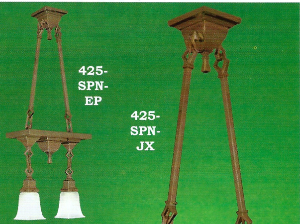
425- SPN- EP

More outstanding, and harder to reproduce, than anything on the market. This fixture, with shades, is only 13 1/2" tall. Nicely Darkened. Each socket is rated for 100 watts, but we recommend 60-75 watts to protect the art glass. We are mixing items on this page to give you an idea how to mix and match lighting