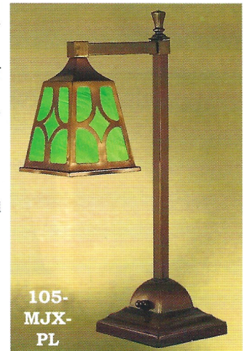
105- MJX- PL

The rectangular pans used in the 425 series lights are 7" x 14" x 1" Lights in this series are mounted to the ceiling with the center finial.