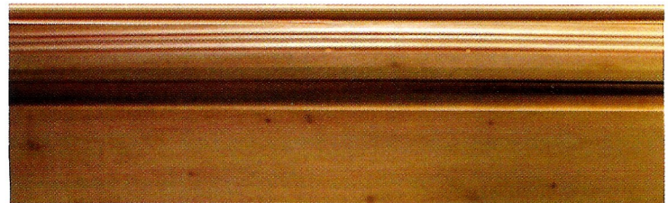
PT-PN80A and PT-CD85A sizes