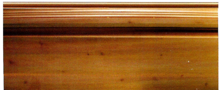
PT-PN80B and PT-CD85B sizes